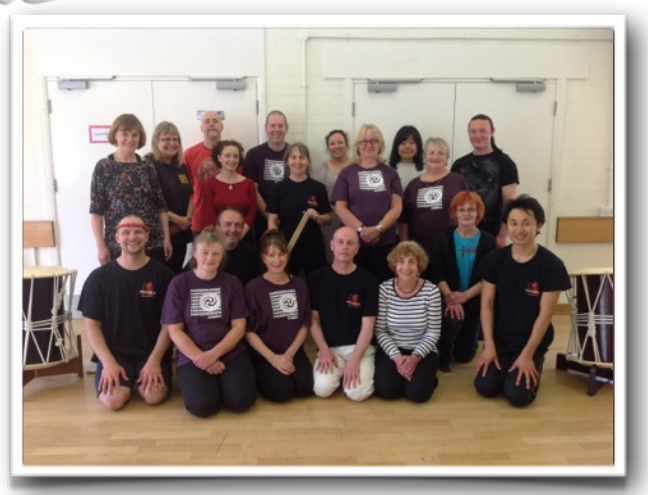
Workshop in Windermere

The heat and humidity were there to welcome us back with a fully booked weekend in Aichi Prefecture. We started off with a guest appearance in two <u>Ensemble Liberta</u> concerts at the Ajioka Shimin Theatre (also in Komaki) and at the Higashi Mino Theatre in Nakatsugawa. It is always a pleasure performing with our favorite koto/ shakuhachi group, especially with their new arrangement of the famous classical