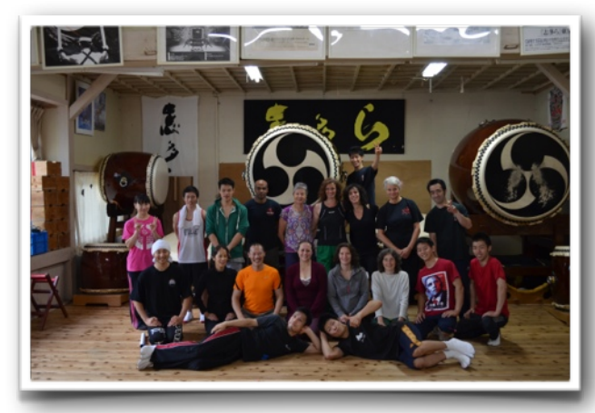
Inadani course members at the Shidara workshop

Our Tokara update comes to a close near the beginning, back in the UK, going through final preparations for the next big event, The Edinburgh Fringe Festival. Yes readers, we are back for another run of performances at C Too Venues for 26 performances in 26 days. So if you are in the area, and have the time to catch one of our shows, we would love to see you there.