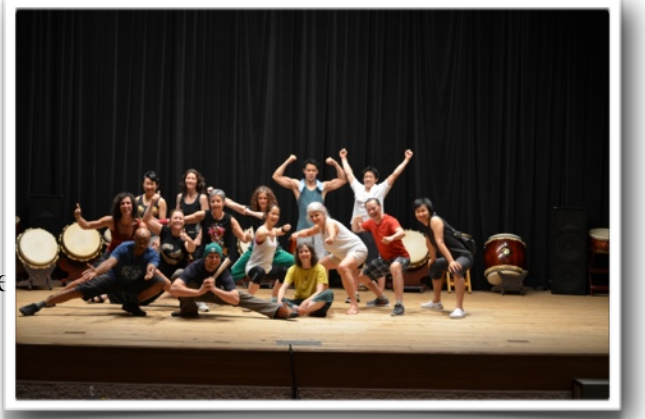
Another Indani course comes to a close

Shidara's dojo, a very famous taiko group based in Toei village in Aichi prefecture. All this, plus the daily practice session sped us right into the end of June and Saiwai Shimoina, which ended up being one of the best festivals yet. Our special guest this year were Hono Odaiko, who are (for those of you that may not know) based out of Asano Taiko. I have very few words to describe the high level of skill and within that group. It was an honor to play alongside them for the encore at the end of the night and has definitely been one of the highlights of the year to date.