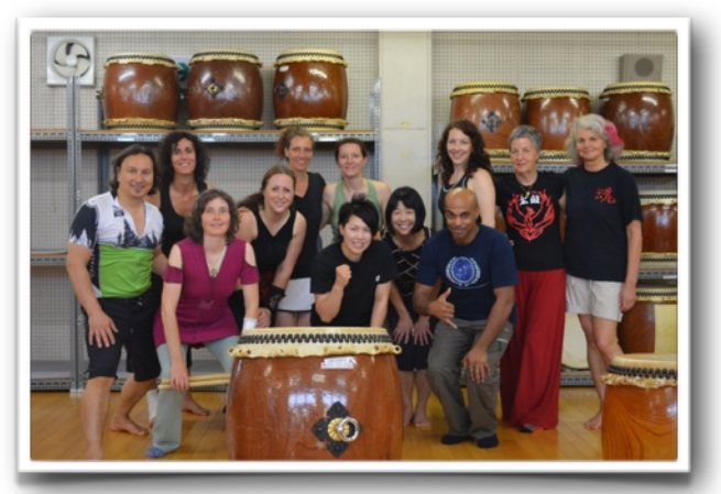
Inadani course members at Asano Taiko workshop

Two weeks of training passed by and we were on the Ferry to Dublin for a surprise mini-Bootcamp. We must of worked hard in Dublin, because each day that passed by, the weather became sunnier and