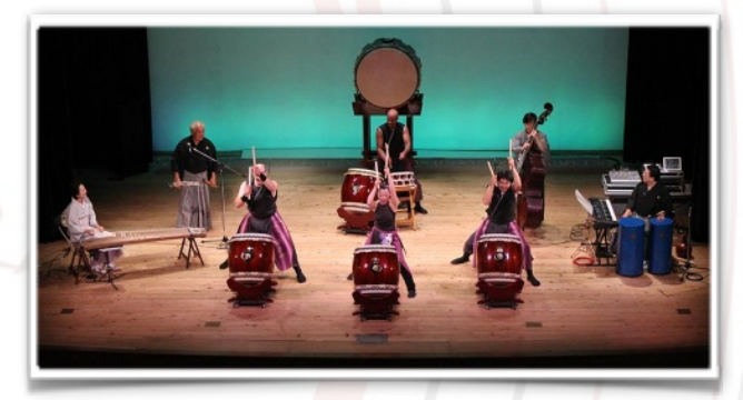
Ensemble Liberta and Tokara in concert

As the summer began to retreat our Japan leg of the tour came to a close. No need to despair however because right around the corner was the Tokara Wadaiko Bootcamp! Participants came to Japan from five different countries, and held their own during this extremely humid time of year. This year's bootcamp participants had a chance to move beyond taiko drums, with afternoon workshops from Ensemble