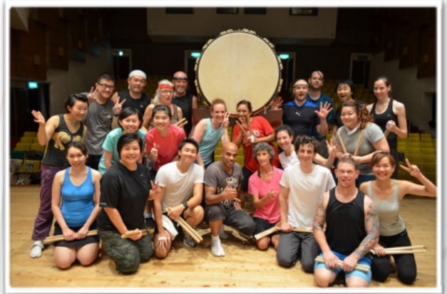
2014 Inadani Wadaiko Course participants

After returning to Japan from the Canadian portion of this year's Kazakoshi tour, we barely had time to land before finding ourselves onstage in Nakatsugawa, guest performing with Ensemble Liberta in the fist Haruka Naru Hibiki concert in Japan.