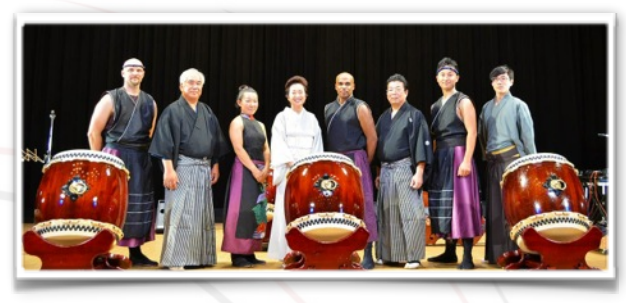
Ensemble Liberta and Wadaiko Tokara

Hello again. Ready for another seasonal update from Wadaiko Tokara? Well, the summer tour has been a fantastic whirlwind as