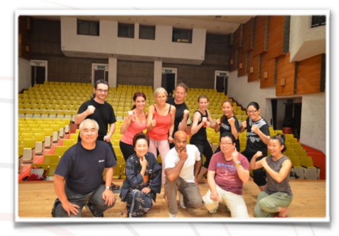
2014 Tokara Bootcamp Participants with Ensemble Liberta

If you missed that performance however, do not worry. We have plenty of performances and workshops in the schedule ahead to bring the final leg of the Kazakoshi tour. You can find all the details you need in the links at the beginning and end of this newsletter, as