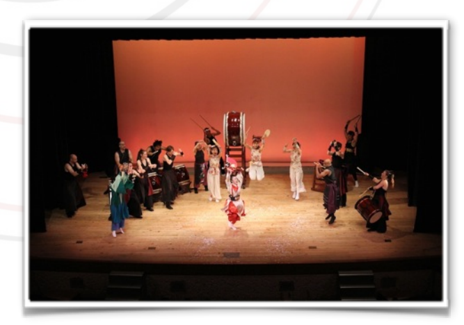
Saiwai Shimoina Super Show encore

Iida city's Wadaiko Stage Crew Ginyudaijin, followed by Belgium's Feniks Taiko and closing with Kodo's Hanayui. Wrapping it up was an encore with a fusion of the four groups, resulting in one unforgettable performance. Definitely a night to remember! The Saiwai Shimoina Wadaiko Festival will be celebrating it's 10th anniversary next year, so stay tuned to Tokara's news feeds for upcoming information. The lineup promises to be an exciting one!