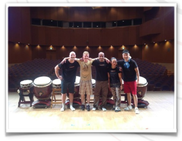
Tokara members from afar unite!

catch their favourite taiko group in performance.