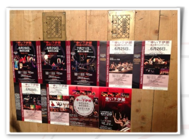
Saiwai Shimoina Wadaiko Festival: 9 years

The Super Show (and after party) had barely finished and we were back into the double tour the next morning. This was the beginning of twelve performances stretched across the next six weeks. We had concerts in Komaki, Yokohama, Nagoya, Iida, Gujo, Osaka, Tokyo, Ina, Takayama, Yaotsu, Kasugai and ending in Kawagoe.