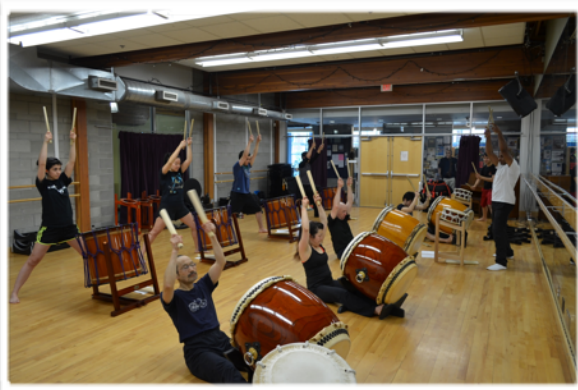
Learning new ways to play Chichibu Yatai Bayashi

shout for an encore even though we were only at the end of the first half. They were quite pleased to hear that a whole second half awaited them after intermission.