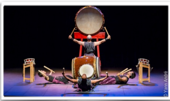
Stretching out during Kazakoshi performance

excitement for the duration of the performance.