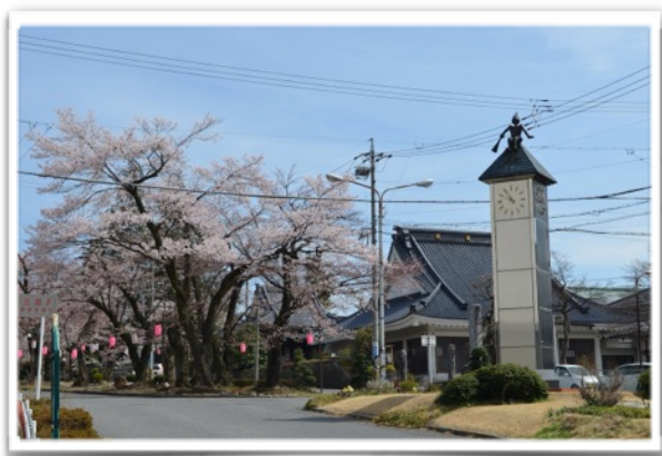
Cherry blossom season in Iida City