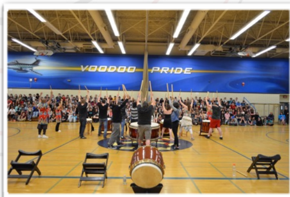
Workshop and Performance at Rutland Senior

Our first concert in Kelowna was the official start of the Kazakoshi 2014 world tour. Kelowna's very own Yamabiko Taiko Ensemble opened for us and we came out to a lively crowd that maintained their