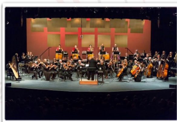
Blending into the Okanagan Symphony Orchestra