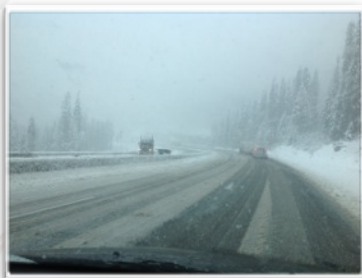
In the mountains