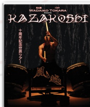
2014 World Tour posters