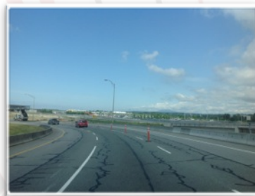
At the airport

Speaking of tours, we had another excellent time during our stay in Kelowna. Once again we were lucky enough to be able to use the Bennett Estate club house as our living space and settled in to prepare for the schedule ahead.